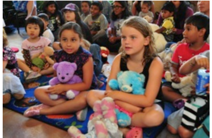
The teddy bear sleepover at Otay Ranch drew a full house in July. Participation in the Summer Reading Program set a record this year.