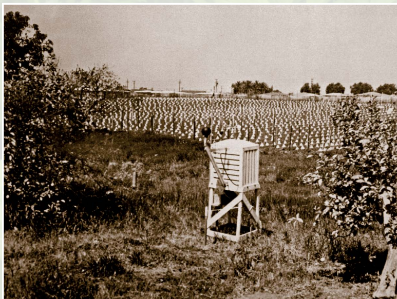
Celery “tents” were first used by Japanese farmers in Chula Vista and eventually were used on farms all across Southern California.

Besides introducing several new crops in Chula Vista, the Muraokas started the use of small tents originally made of used newspaper. These “tents” protected the celery and cucumber plants from harsh weather when the small seedlings were just planted in the