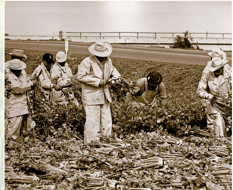
After celery was picked in Chula Vista it was boxed and sent to markets across the U.S.